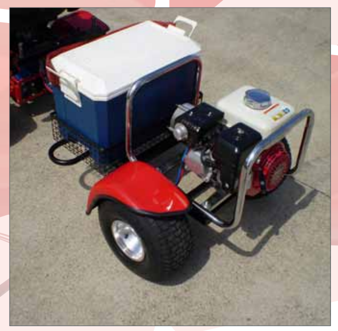
Scooter shown with optional hybrid Trailer & Esky Carrier.

Remote chargers are available, enabling independence from 240v power supply. If you desire to travel a greater distance, our hybrid version is available to switch between either (petrol or electric), perfect for a day transport from base camp.