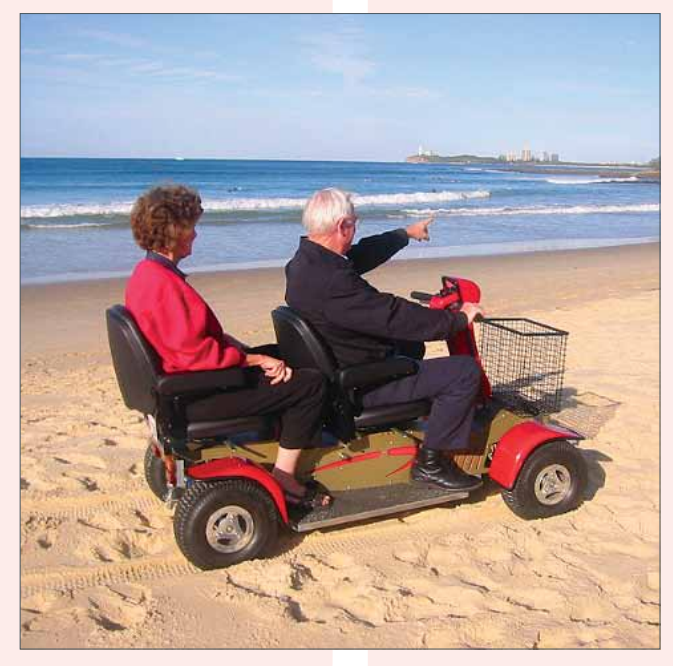
Suitable for most off-road and outdoor conditions.

Containing exceptional stability, power and reliability for a smooth ride. Both the front and the rear are stocked with independent adjustable coil spring suspension and electronic limited slip differentials adding to the performance of this vehicle.