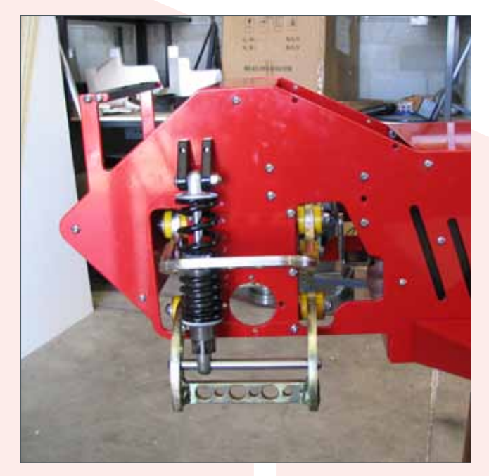
Manufacturing the VG2 in our Sunshine Coast facility.

We handle all our sales from our Sunshine Coast manufacturing facility and individually build each product here in our own factory. Nybro ATV's are 100% Australian made, including the electric motors.