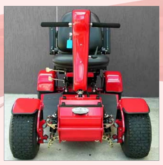
70mm of travel in the front suspension.

This Australian designed and manufactured electric ATV has in-line seats rotating the full 360 degrees for unrestricted access.